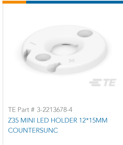
TE Part # 3-2213678-4 Z35 MINI LED HOLDER 12*15MM COUNTERSUNC